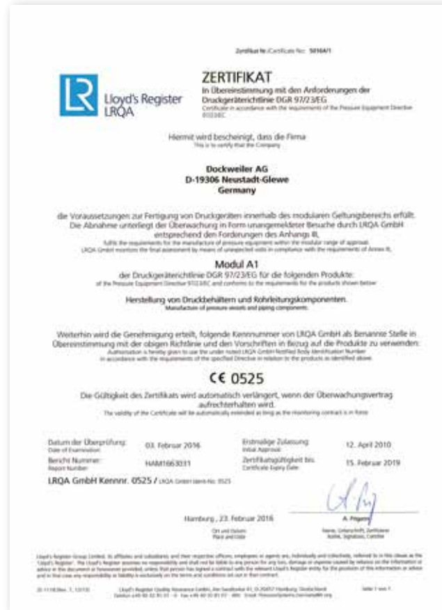
DGR 97 23 EG and AD 2000 WO