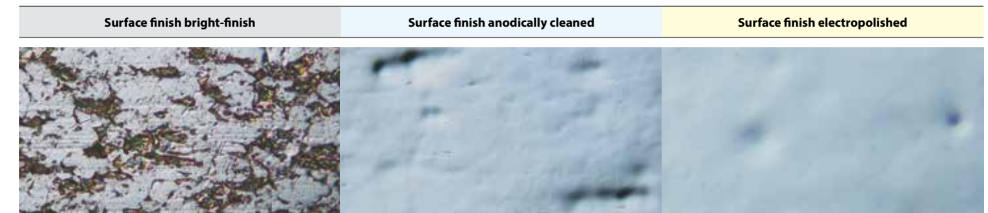
All pictures show the respective surfaces in a 380-fold magnification.