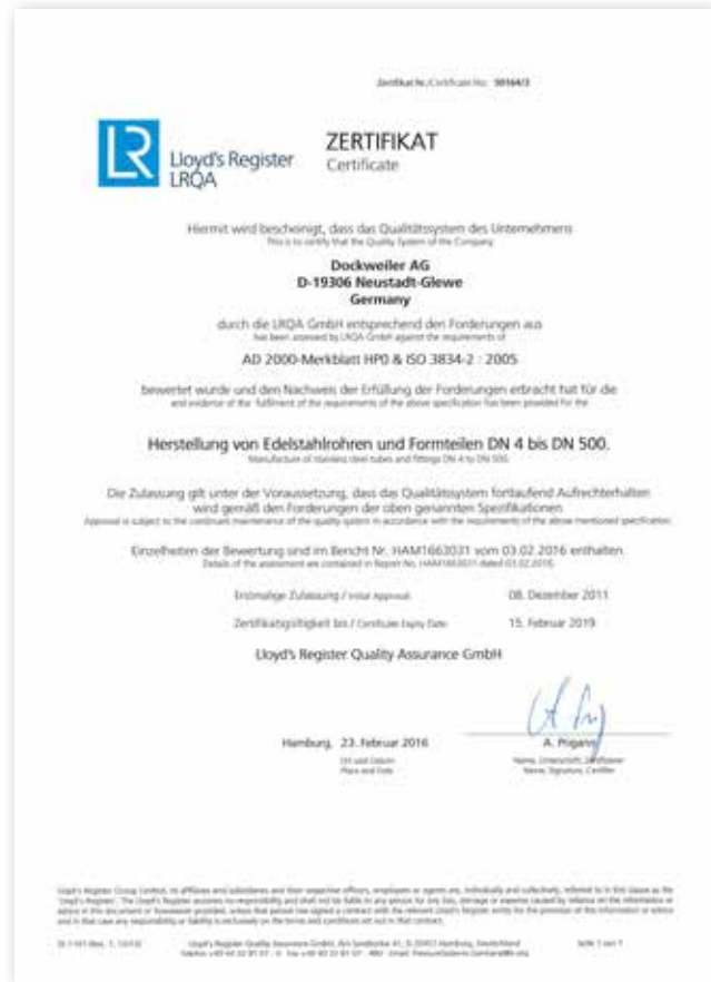
AD 2000 HPO