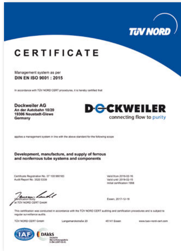
DIN EN ISO 9001