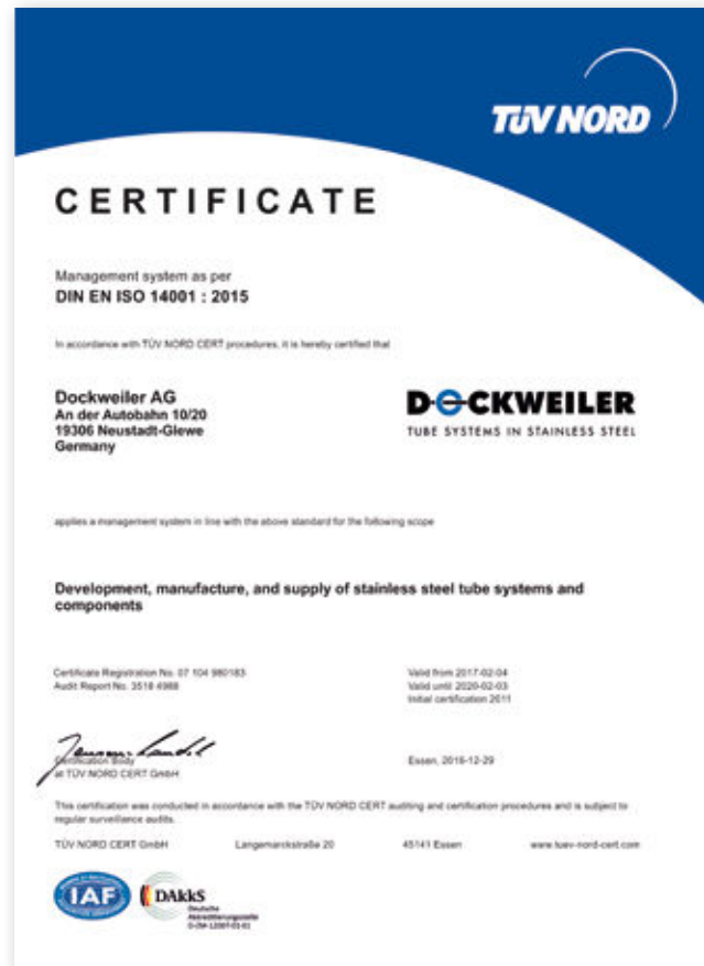
DIN EN ISO 14001