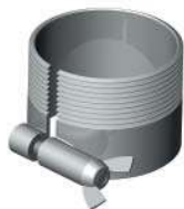
2" threaded clamp for drums