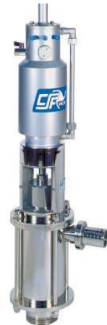
PA.A short pump