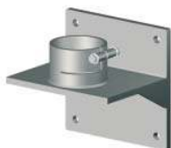
Wall brackets for holding and fixing pumps