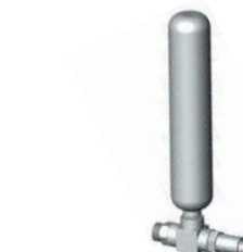
Outlet Pulsation Dampener