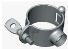
Light clamp with threaded connection